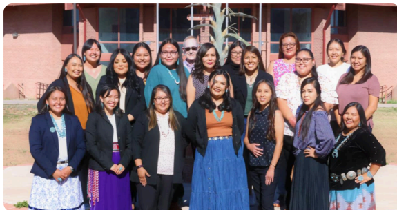
2022 SREP Students, Faculty, & Staff

For more information, visit our website: