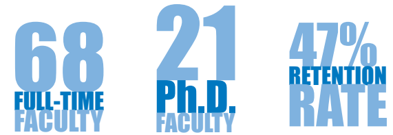
Fall 2018 Institutional Statistics